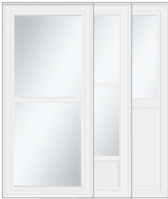
146FV 146MV 146HV

Storm doors from the Easy Vent and Elegant Selections are constructed with low-maintenance aluminum and surrounded by a dual weatherstrip for exceptional weather resistance. Their two-closer system provides extra stability and features a hold-open button. An overlapping edge helps seal out the elements and conceals the hinges.