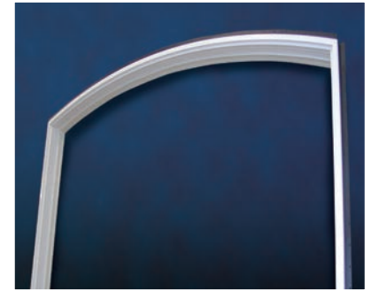
Arch Top Frames—The Look of Today for the Discriminating Home Owner