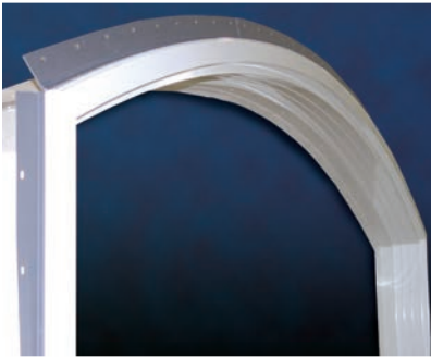
10" Arch Rise—Standard; 12" Arch Rise—Optional